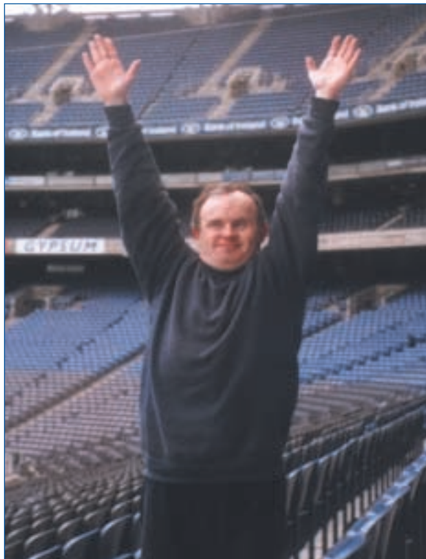
Trip to Croke Park