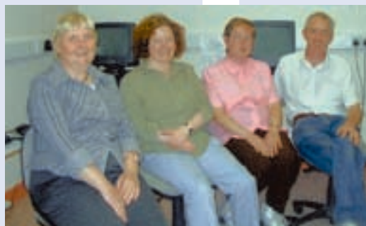
Athlone service users

Service users from Athlone sheltered workshop recently attended a Community Food and Health course. The course included: a fresh look at food; a focus on fat; a focus on fibre; sensible shopping; a talk by a dietitian and a presentation of Certificates. The feedback from participants on the course was very enthusiastic. One service user commented that home made burgers taste even better than McDonalds! Other centres may be interested in contacting their local health board to see if similar courses are run in their area.