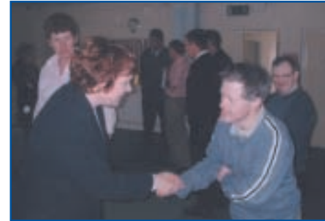
Dana's visit, Ballinamore RehabCare

On May 7th this year we had a surprise visit from Rosemary Scallen M.E.P. better known as "Dana", Ireland's Eurovision winner in 1970 – she was canvassing in Ballinamore for re-election to the European Parliament.